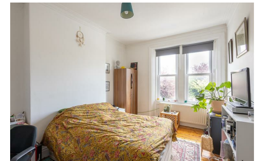
2ND FLOOR 317 sq.ft. (29.5 sq.m.) approx.